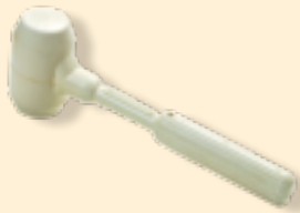
White rubber mallet