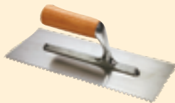
Trowel stainless steel 8 mm square serrations