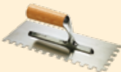
Trowel stainless steel 10 mm square serrations