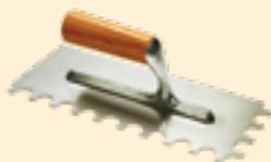
Trowel stainless steel Ø 15 mm rounded serrations