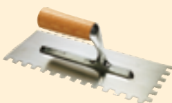
10x10 mm trowel