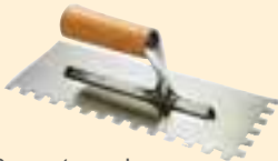
10x10 mm trowel