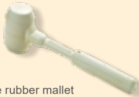
White rubber mallet