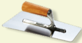
28x12 cm smooth trowel